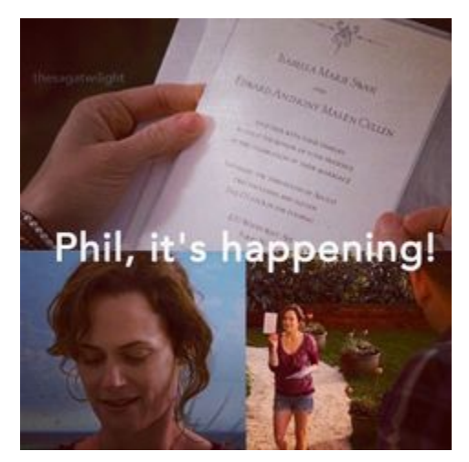
(Yes, this is from Breaking Dawn)

The resources are printed and ready to go! Again I'm so sorry for the delay but things are looking good, and I'm so excited. I'm looking for volunteers who would be willing to